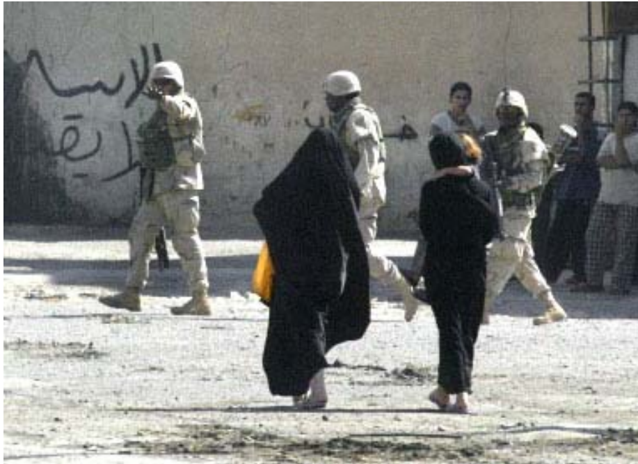
Sadr City

BUSH'S SITTING DUCKS: BRING YOURSELF HOME NOW!