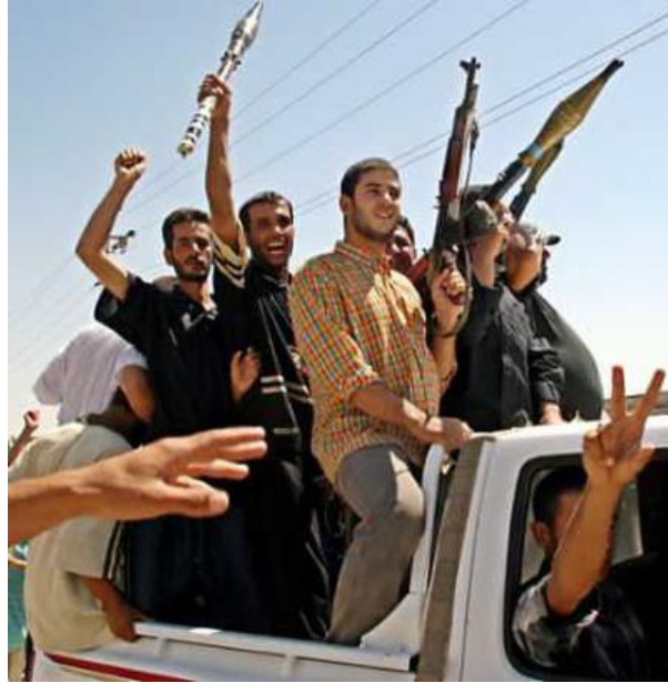
Mahdi Army troops in al-Sadr city.