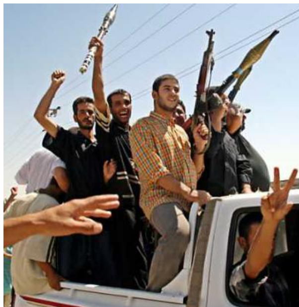
Mahdi Army troops in al-Sadr city.