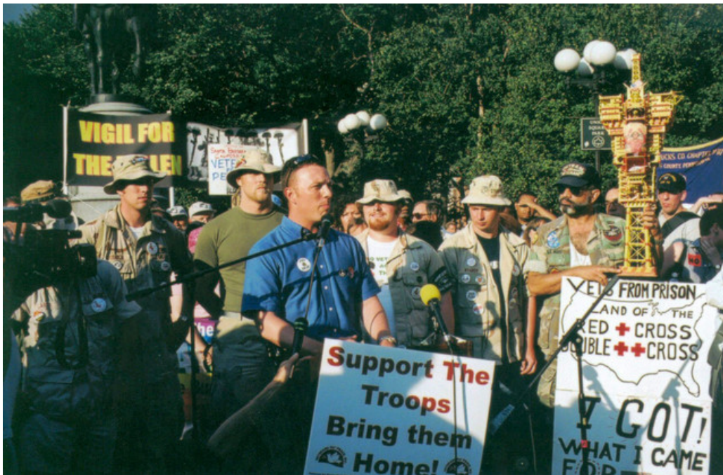
Iraq and Vietnam Veterans Against The War, Union Square, NY City 9.2.04 ( http://www.anywhichway.net/gallery/Veterans_Vigil_for_the_Fallen )