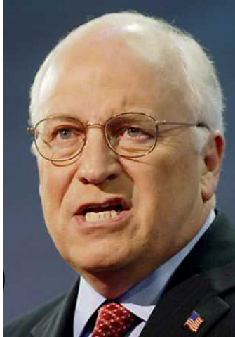
Cheney September 1, 2004.