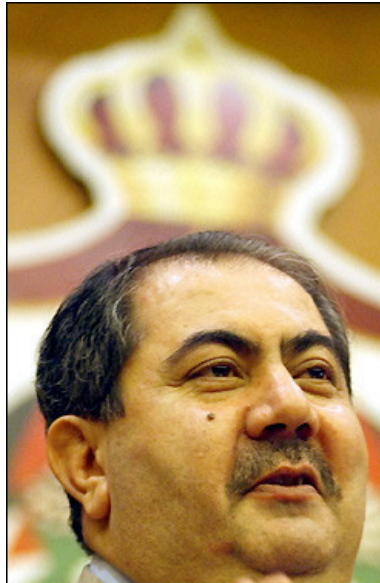
Iraqi interim Foreign Minister Hoshiyar Zebari speaks at a press conference in Amman.

HAVE YOU NOTICED... HOW THE LEADERS OF THE PUPPET GOVERNMENT ARE THIS COLLECTION OF DISGUSTING SLIMY SLUGS?