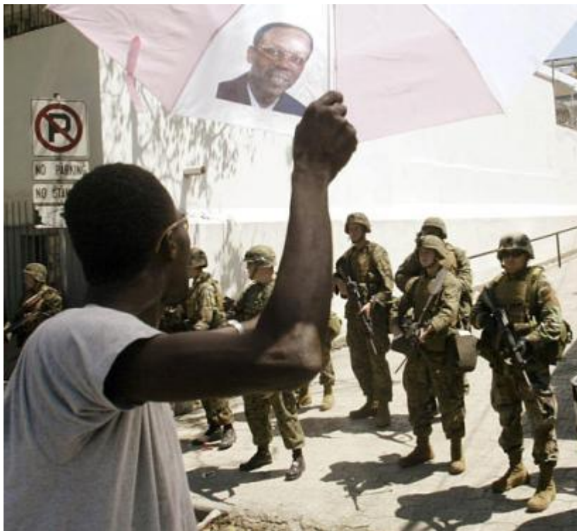
A supporter of President Jean-Bertrand Aristide shouts anti U.S. slogans at American soldiers guarding the U.S. consulate in Port-au-Prince, Haiti Friday March 5, 2004.