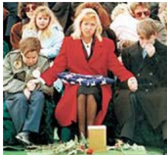
A family celebrates the "victory" In Iraq.

"Make no mistake, the level of morale for most soldiers that I've seen has hit rock bottom." Anonymous Officer, 3rd Infantry Division, U.S. Army, in Iraq