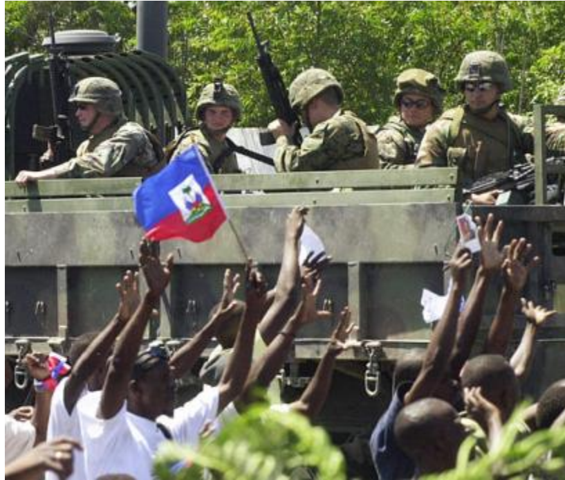
Supporters of former President Jean-Bertrand Aristide march asking for his return near US Marine patrolling near the US Embassy in Port-au-Prince, Haiti March 5, 2004.