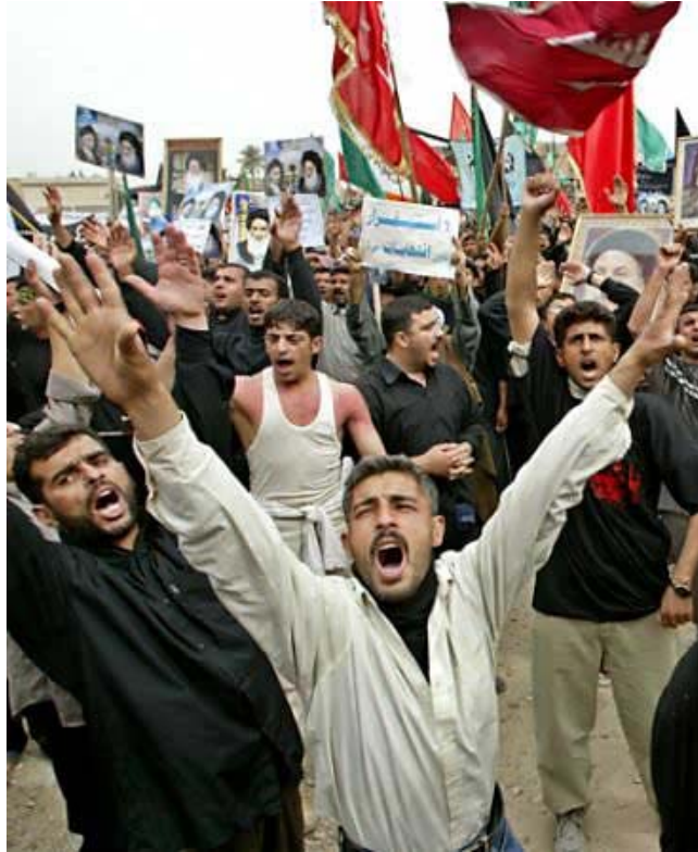
Iraqi Shi'ite men shout during a rally in the Iraqi capital Baghdad, March 1, 2004. Shi'ite demonstrators demanded a fixed date for elections.