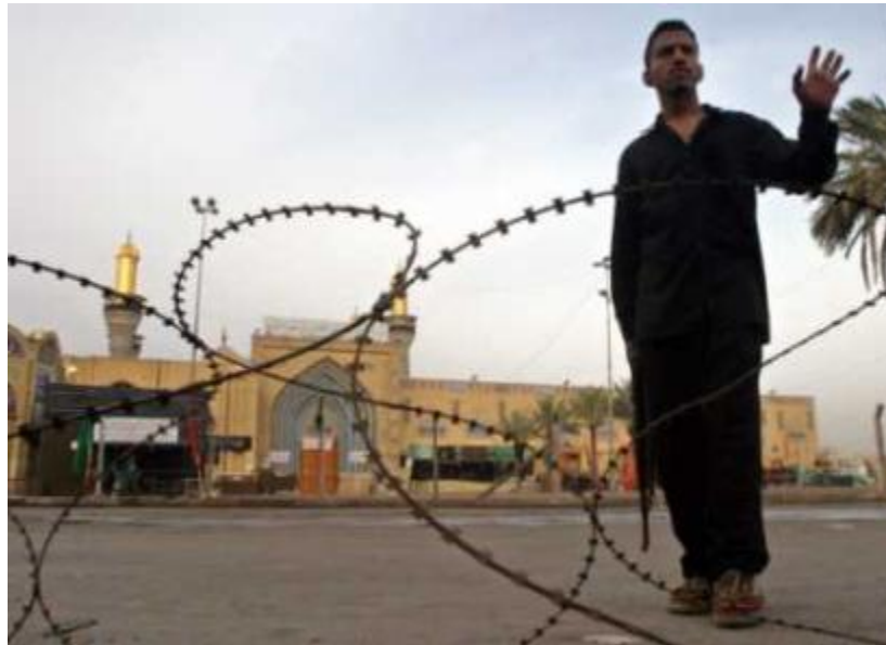
An armed Shi'ite militiaman March 3, 2004.