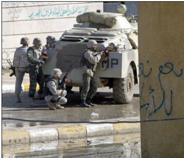
Ukrainian soldiers take shelter behind a military vehicle in Kut before fleeing the city south of the capital Baghdad.