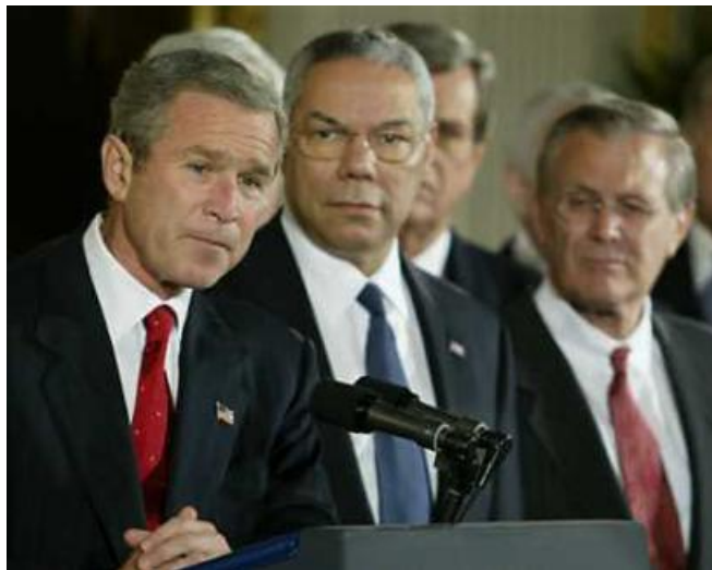
The Liars' Club: Oct. 16, 2002

Photo op as Bush gets ready to sign the Iraq war resolution passed by the Democrats in Congress (and Republicans too) because Iraq had WMDs that could hit the USA.