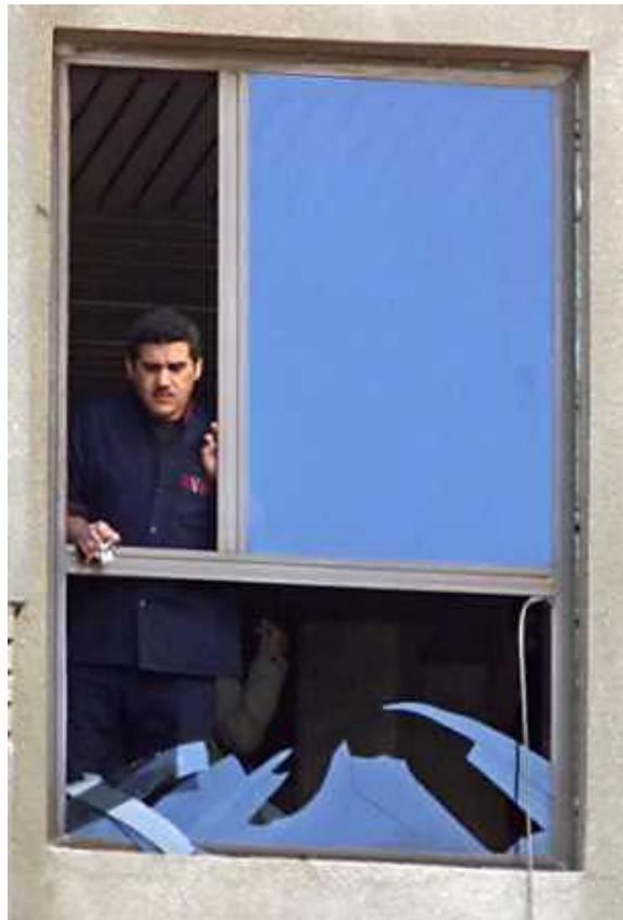
A man looks out a window at Baghdad's Burj al-Hayat hotel, used mainly by foreign businessmen, following a rocket propelled grenade attack January 9, 2004.

No one was hurt in the dawn attack on the Burj al-Hayat hotel in central Baghdad, which is used mainly by foreign businessmen and US army contractors. Three rockets hit rooms around the fourth floor, smashing windows, security guards said. The guards said they exchanged fire with men in a car as the hotel came under attack.