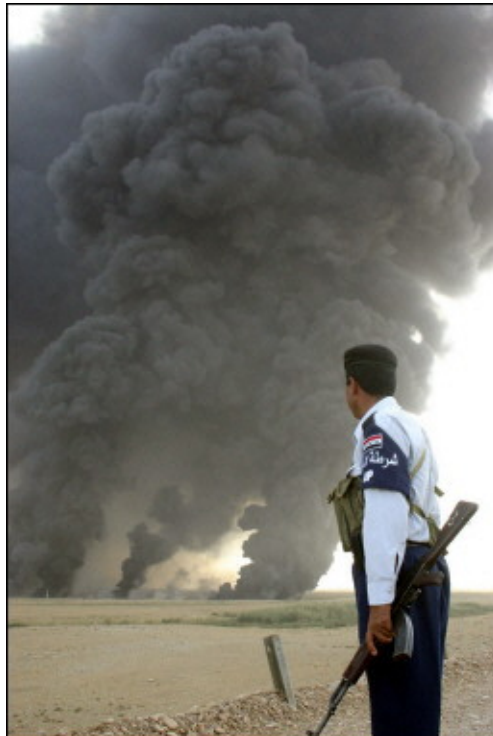
Main road 16 miles west of Kirkuk, northern Iraq.

“There's only 3.5 million barrels in storage now,” said a Ceyhan port agent. “The pumping was stopped this morning because of the explosion,” he said.