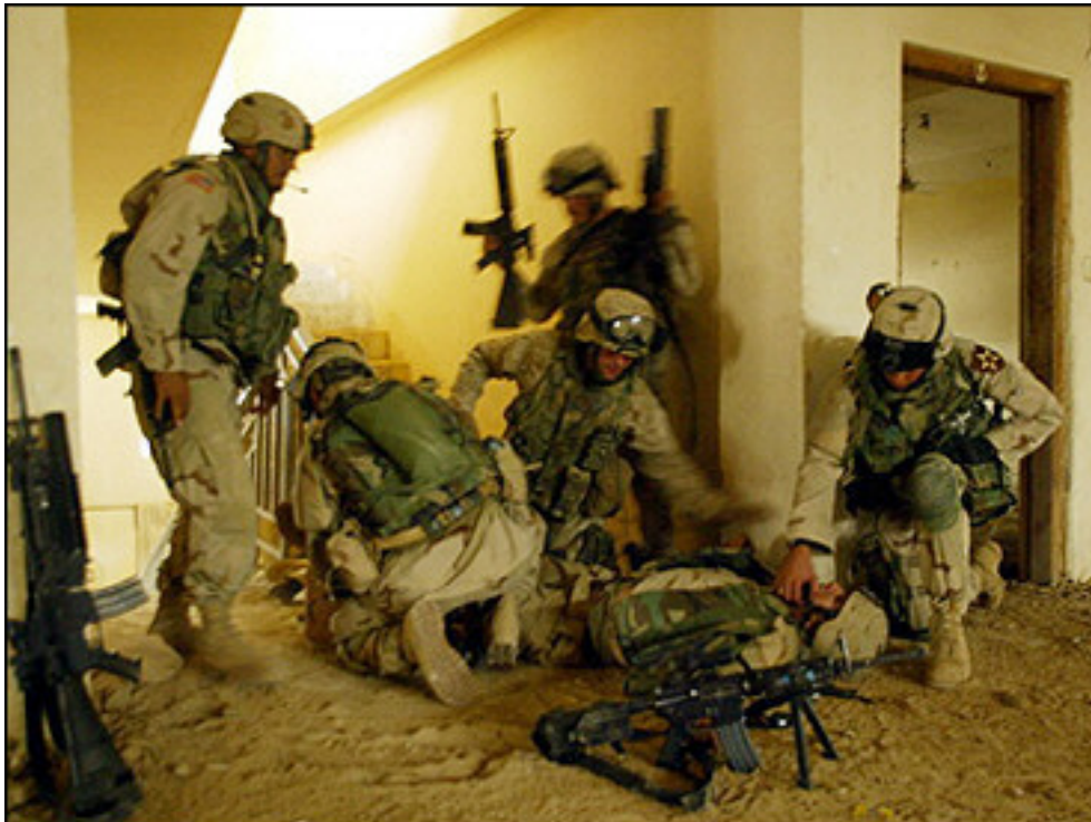
US Army soldiers and a marine (C) treat an injured comrade shot by a sniper in Ramadi.

HOW MANY MORE FOR BUSH'S WAR? BRING THEM ALL HOME NOW!