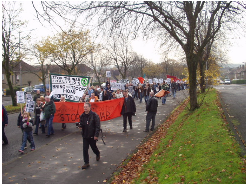
Marching along Braidcraft Road, Pollok.