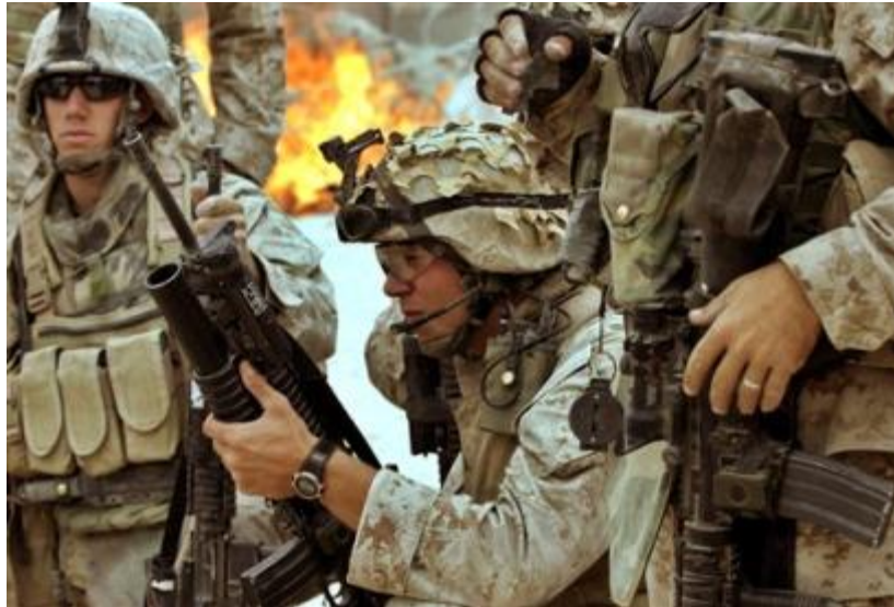
Marines of the 1st Division: Fallujah Oct. 30, 2004.

MISSION: DIE FOR GEORGE W. BUSH AND THE EMPIRE: BRING THEM ALL HOME NOW!