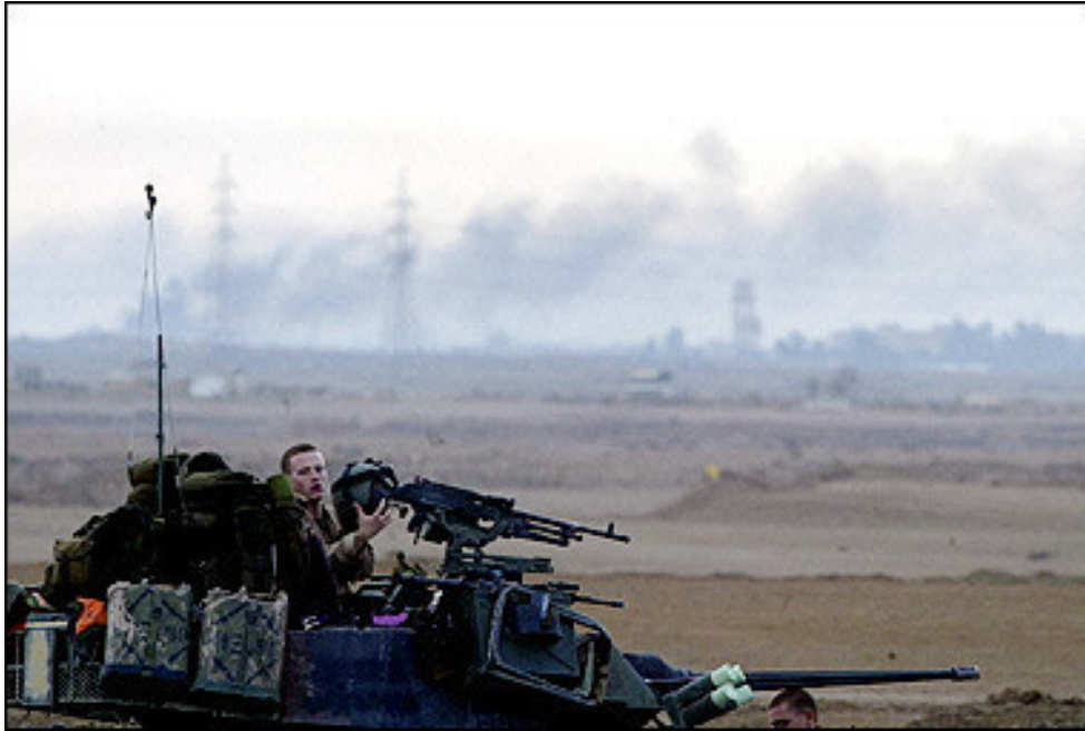
A US soldier sits in his armoured vehicle during the bombardment of Fallujah 11.9.04