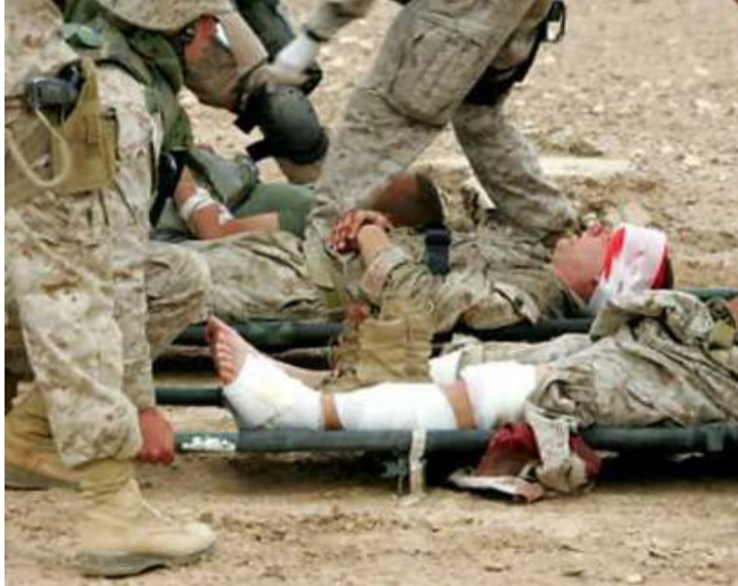
U.S. Marines Falluja, November 9, 2004.