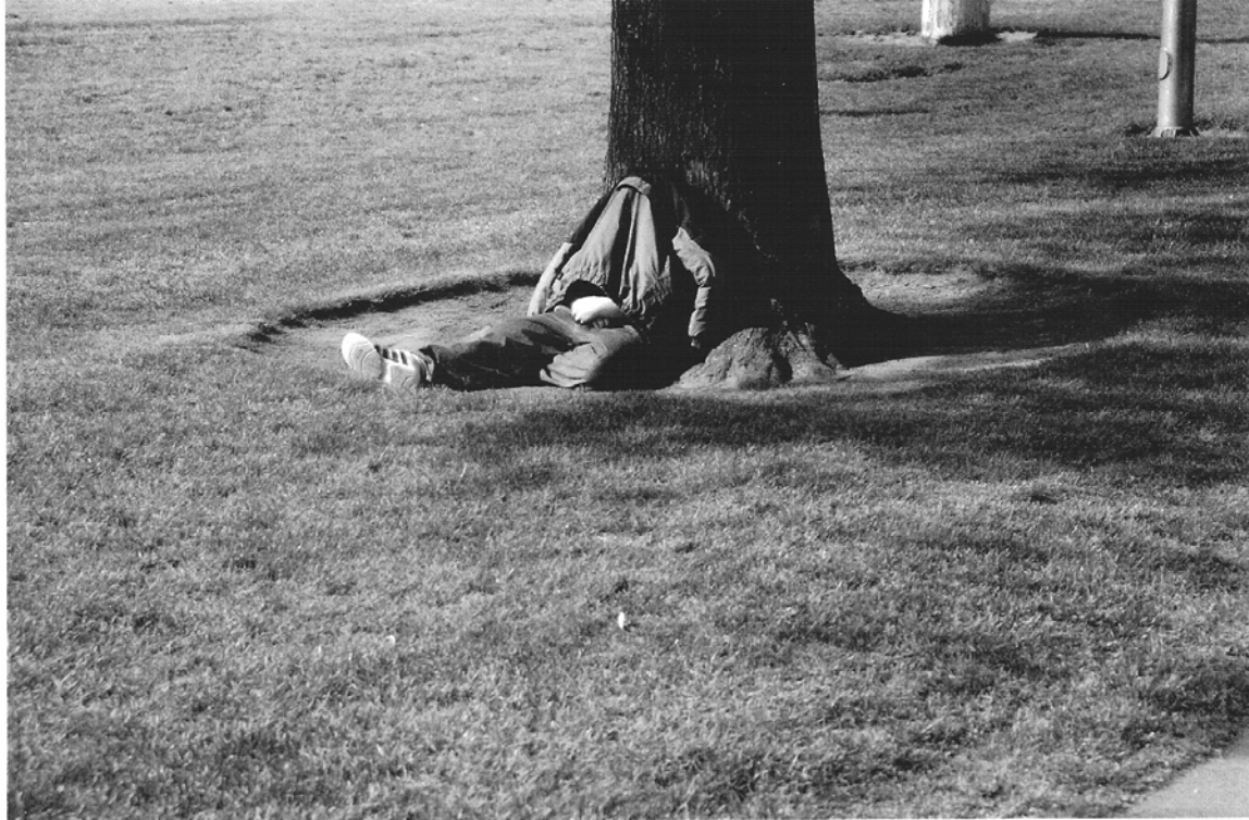
Homeless military veteran in city park – because it's a free country.