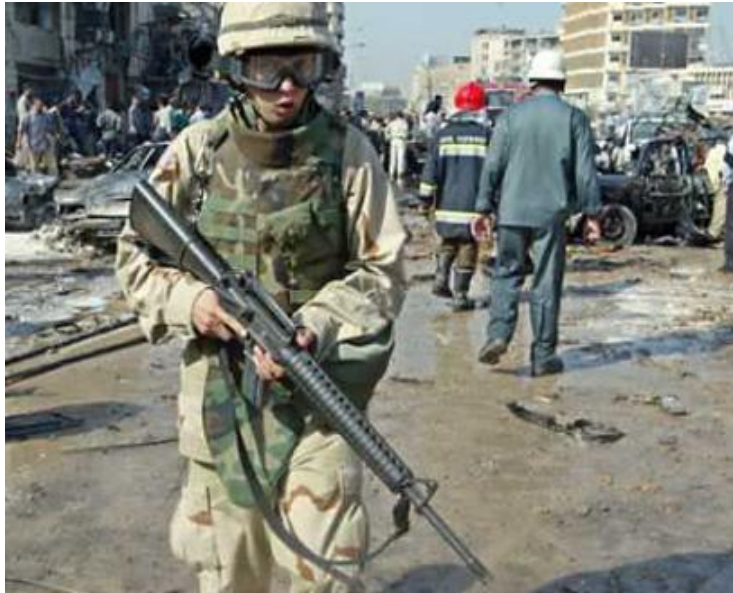
A U.S. soldier at the scene of a car bomb attack in central Baghdad November 11, 2004.