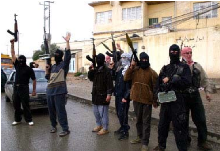
Armed fighters took control of various parts of Mosul

In Mosul, Iraq's third-largest city, insurgents on Thursday raided police stations and political offices. U.S. and Iraqi forces were still battling guerrillas hours later, and an American official acknowledged it could take "some time" to secure the city.