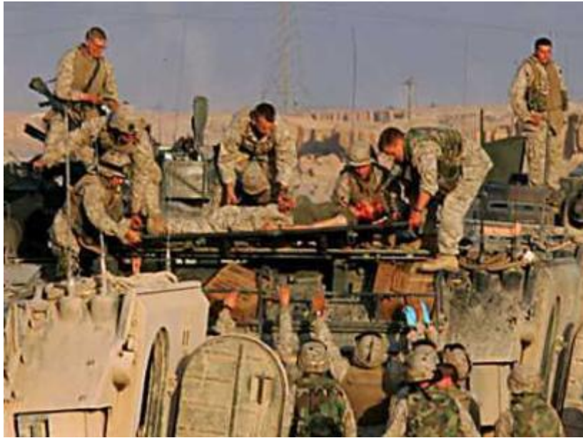
U.S. Marines carry an injured colleague after a mortar explosion close to their position in of Falluja, November 10, 2004.