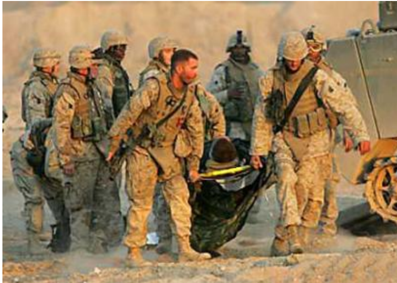
U.S. Marines evacuate an injured comrade after a mortar explosion near Falluja November 10.