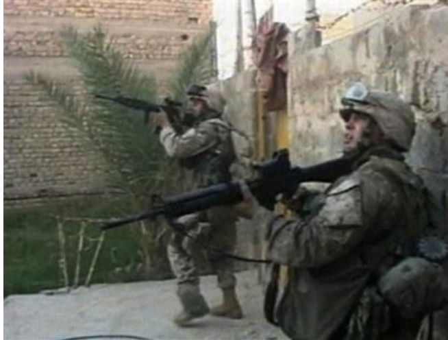
US soldiers, Fallujah, Nov. 10.