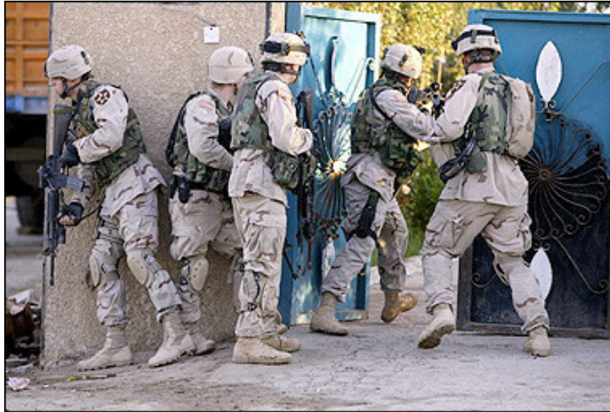
US soldiers force their way into a house in Ramadi.