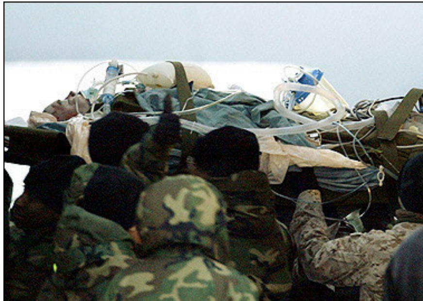
A US soldier wounded in Mosul is transferred from a C-141 military transport aircraft to an ambulance, at the US airbase of Ramstein. (12.22.04 AFP/DDP/Thomas Lohnes)