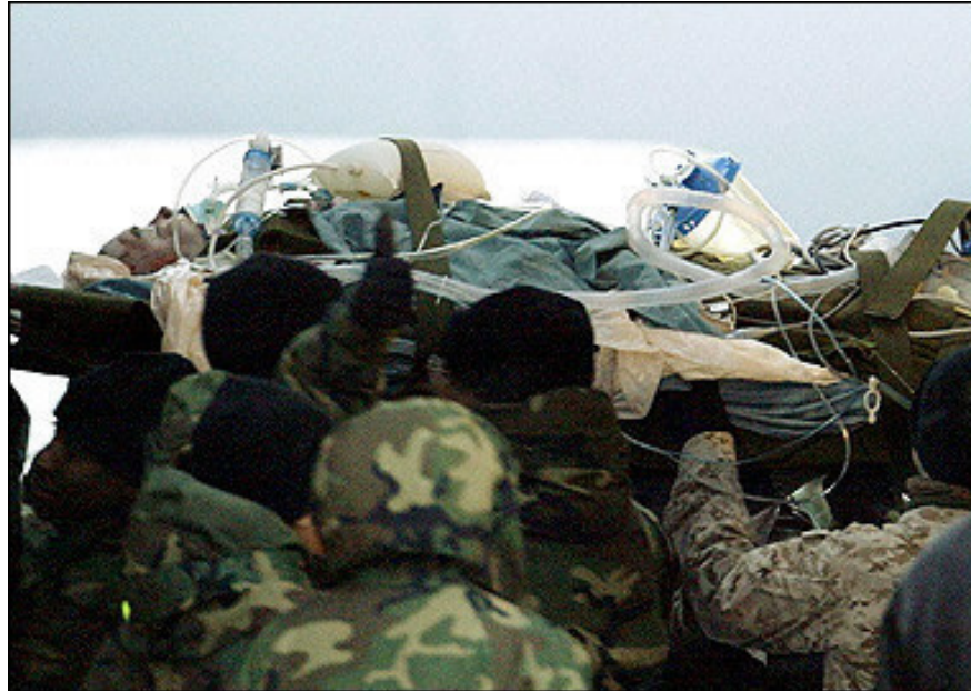
A US soldier wounded in Mosul is transferred from a C-141 military transport aircraft to an ambulance, at the US airbase of Ramstein. (12.22.04 AFP/DDP/Thomas Lohnes)