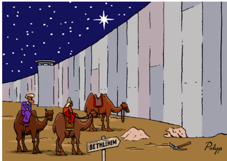
The Staff of Uruknet