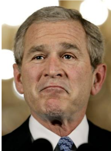
Feb. 21, 2005.