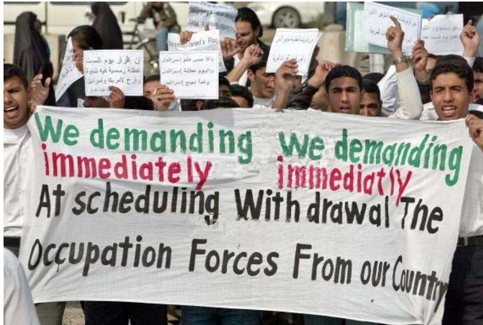
2.28.05 Anonymous, Infoshop News