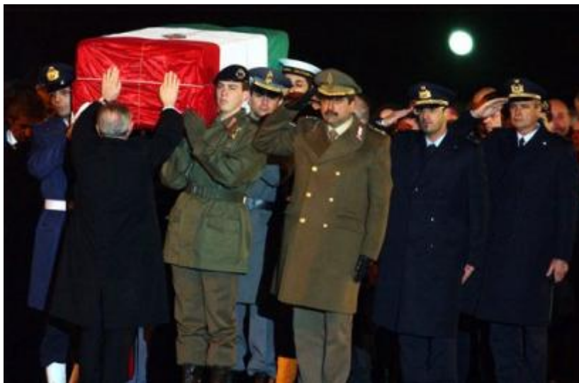
Italian President Carlo Azeglio Ciampi honors the fallen.