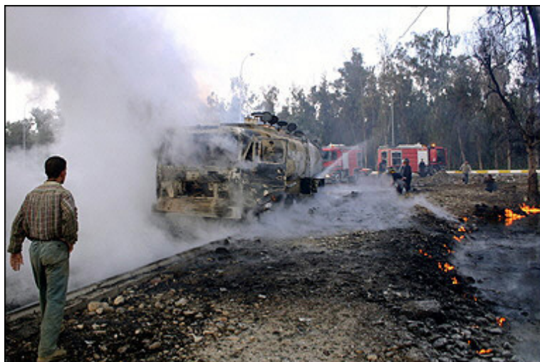
Mar 5: Fire fighters douse the flames from a convoy tanker truck after it blew up in the northern city of Mosul.

Also in Mosul, a Kurdish employee working for the Patriotic Union of Kurdistan, one of two main Kurdish parties, was killed, a party official said.