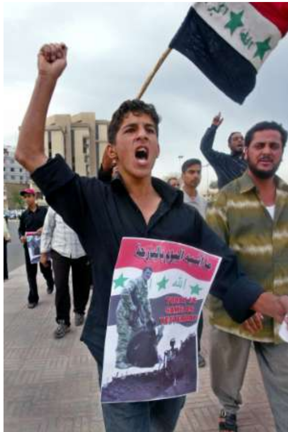
April 9, 2005.

There are indications that the Sunni and Shiite anti-occupation forces are collaborating. In Baqubah, about 35 miles northeast of Baghdad, spokesmen for Sadr and the Association of Muslim Scholars said in interviews Friday that they supported each other's calls for a U.S. withdrawal.