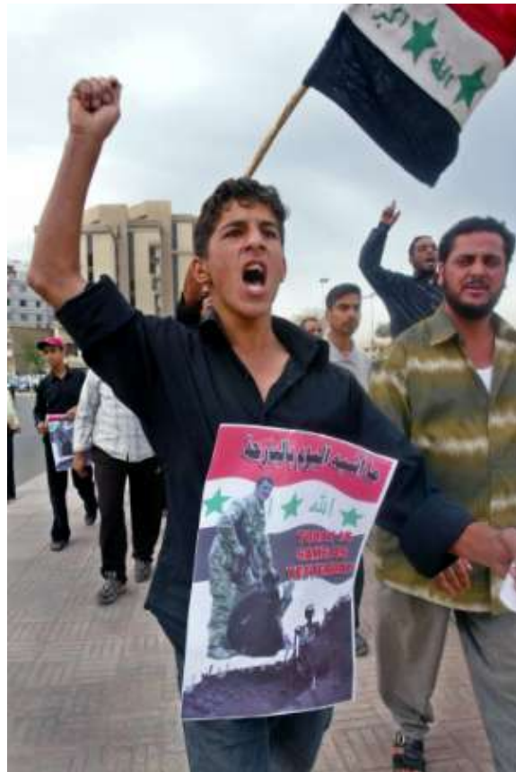
April 9, 2005.

There are indications that the Sunni and Shiite anti-occupation forces are collaborating. In Baqubah, about 35 miles northeast of Baghdad, spokesmen for Sadr and the Association of Muslim Scholars said in interviews Friday that they supported each other's calls for a U.S. withdrawal.