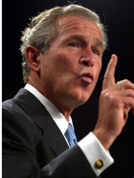
“The Number One Terrorist In The World”