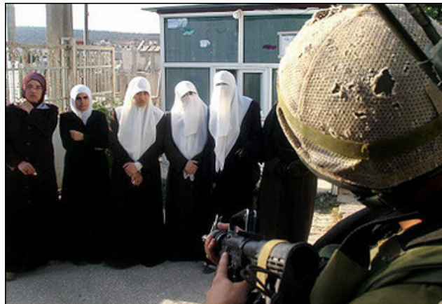
7.15.05: Zionist occupation soldiers aim weapons at Palestinian women trying to get to the hospital to check on wounded relatives following Israeli helicopters strikes in the occupied Palestine West Bank village of Selfit