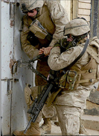
7.15.05 US Marines shows Marines breaking a lock to building in the city of al-Ramadi, west of Baghdad.