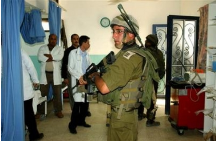
7.15.05: Zionist soldiers forced their way inside a hospital in the occupied Palestine West Bank town of Salfit, July 15, 2005.