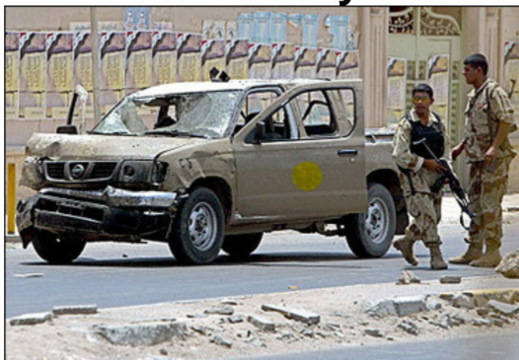
7.15.05 Occupation military vehicle that was hit in a car bomb attack in Baghdad.