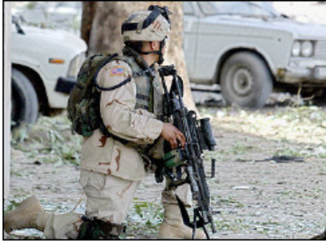
US soldier, Baghdad