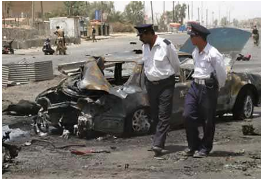
Iraqi policemen eyeball vehicle after a car bomb attack on an Iraqi army convoy.

Fighters attacked a checkpoint near the headquarters of the Iraqi Police Major Crimes Unit in western Baghdad on Thursday, killing two police officers and wounding four others.