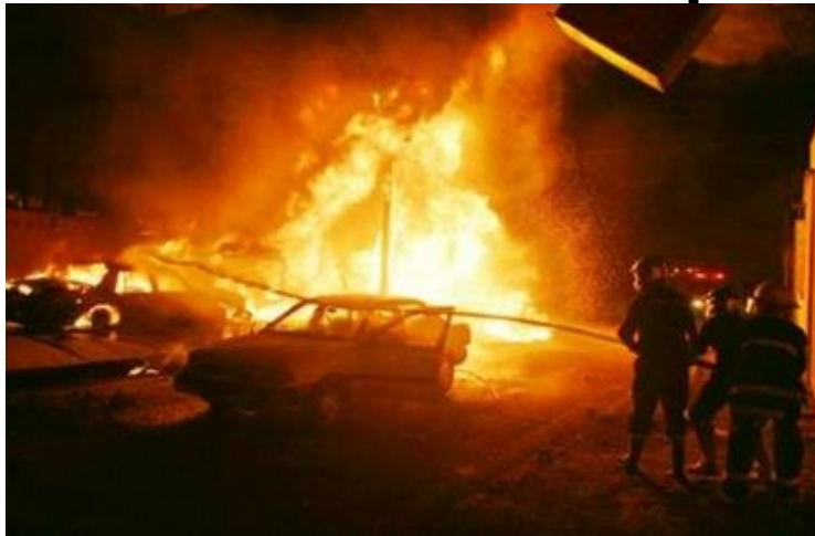
Exploded electric generator in Baghdad late July 14, 2005.