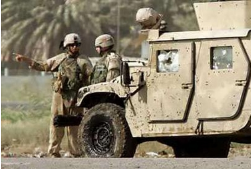
U.S. soldiers stand next to a damaged Humvee after a roadside bombing in Baghdad