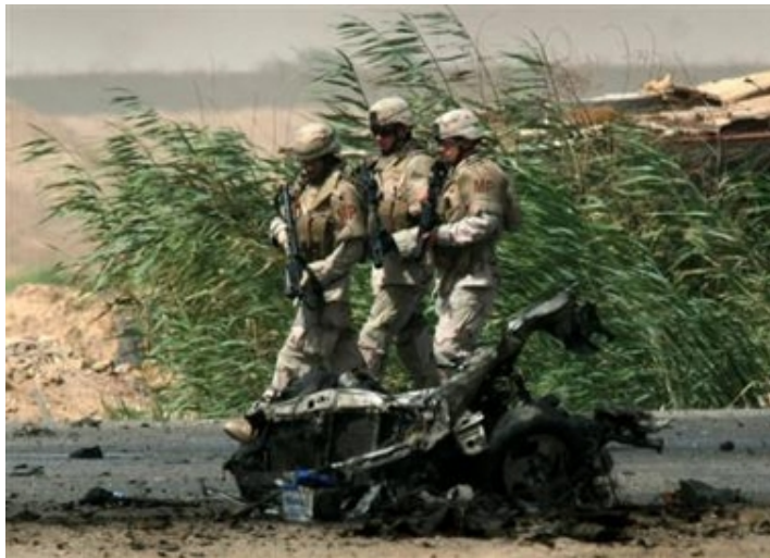
7.15.05 U.S. troops at the scene of a carbomb attack which targeted a U.S. military convoy in the Rustamiya area of Baghdad, Iraq July 15, 2005.