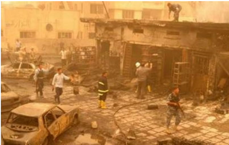
Iraqi soldiers and fireman at scene of a bomb blast in Baghdad July 24, 2005 outside a police station.