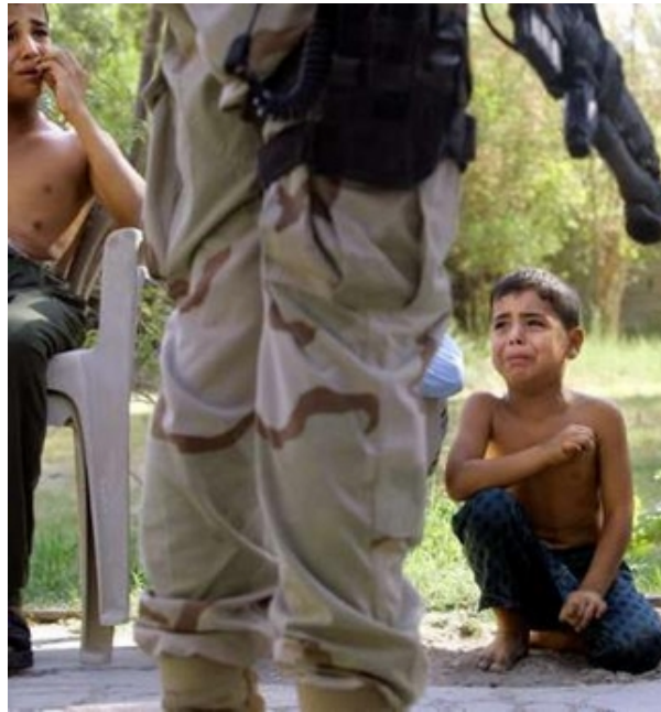
August 3, 2005.

WHO WAS IN COMMAND OF THIS ? (PAYBACK IS CERTAIN, AND IT WILL BE TERRIBLE.)