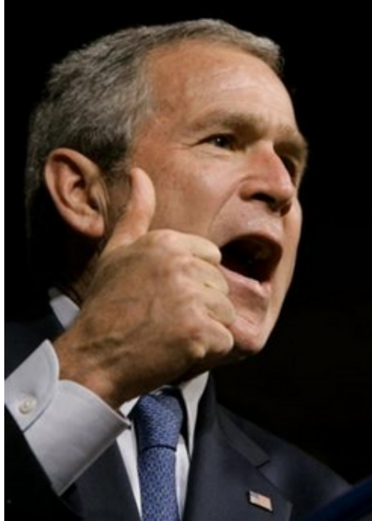
Aug. 3, 2005.

Do you have a friend or relative in the service? Forward this E-MAIL along, or send us the address if you wish and we'll send it regularly. Whether in Iraq or stuck on a base in the USA, this is extra important for your service friend, too often cut off from access to encouraging news of growing resistance to the war, at home and inside the armed services. Send requests to address up top.