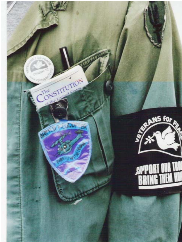
Vietnam Veteran Armed With The Truth