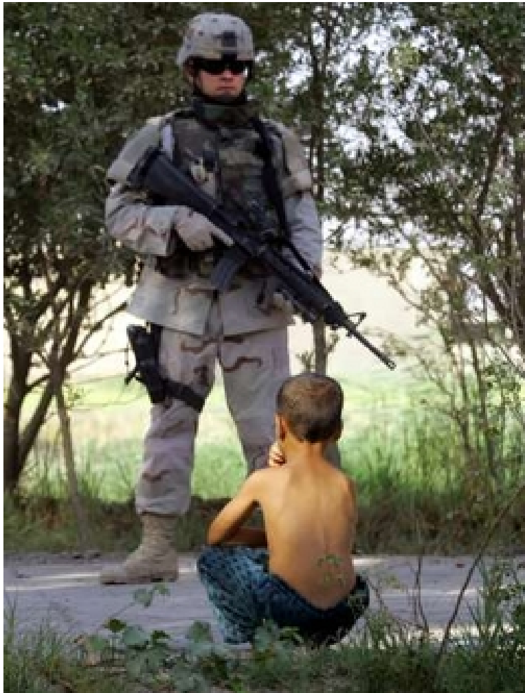
An U.S. soldier of the 3rd battalion, 7th Infantry, 4th Brigade, 3rd Infantry Division from Ft Benning, Georgia guards an Iraqi boy as his father is detained during a raid searching for illegal weapons inside their house in Baghdad August 3, 2005.