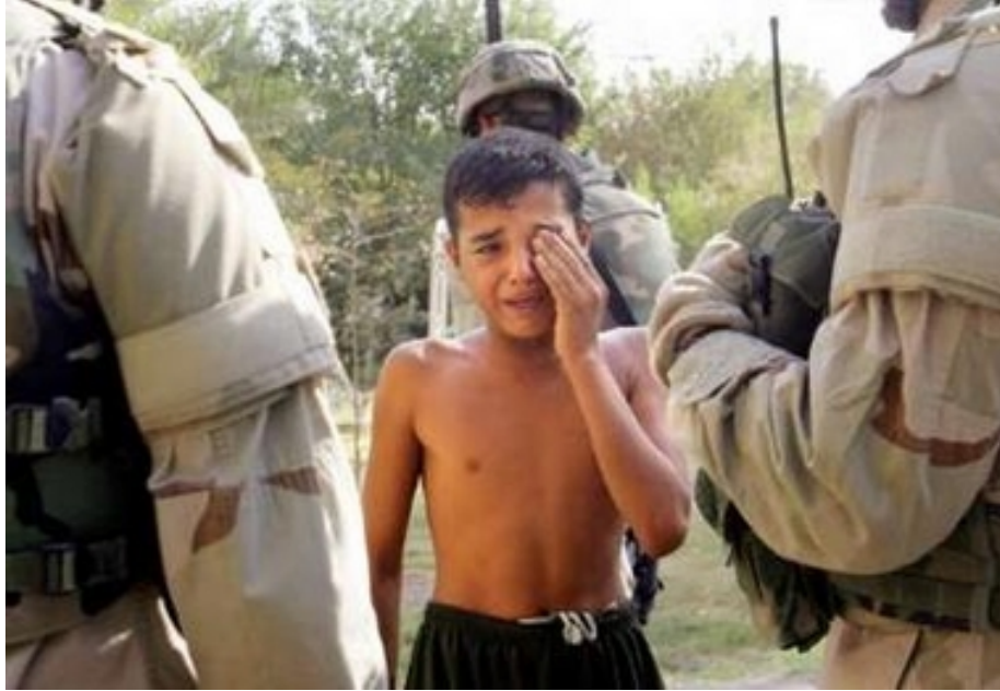
An Iraqi boy cries as he is questioned by U.S. soldiers of the 3rd battalion, 7th Infantry, 4th Brigade, 3rd Infantry Division from Ft Benning, Georgia during a raid, searching for illegal weapons inside his house, in Baghdad August 3, 2005. Email Photo Print Photo