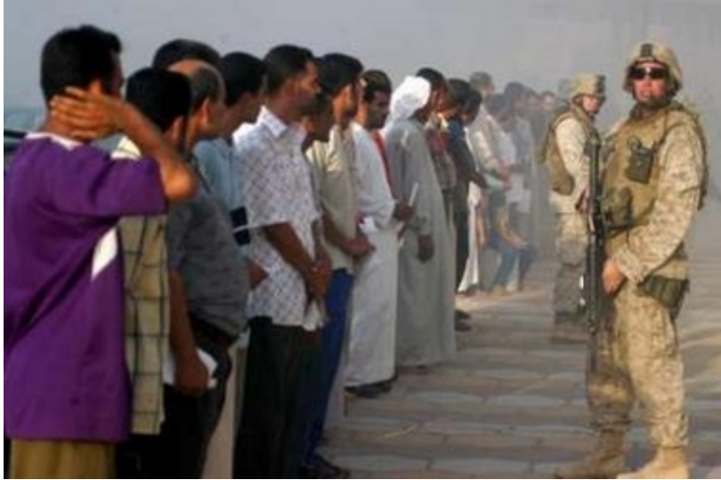
U.S. Marines with the 5th Marine Regiment guard Iraqi men as Marines search their cars in Ramadi July 25, 2005.

There's nothing quite like invading somebody else's country, forcing the citizens who live there out of their cars at gunpoint, publicly humiliating them in front of their families by lining them up like prisoners of war, and arresting any who object. This is guaranteed to arouse an intense desire to kill you as soon as possible in every the patriotic, self-respecting civilian who lives there.