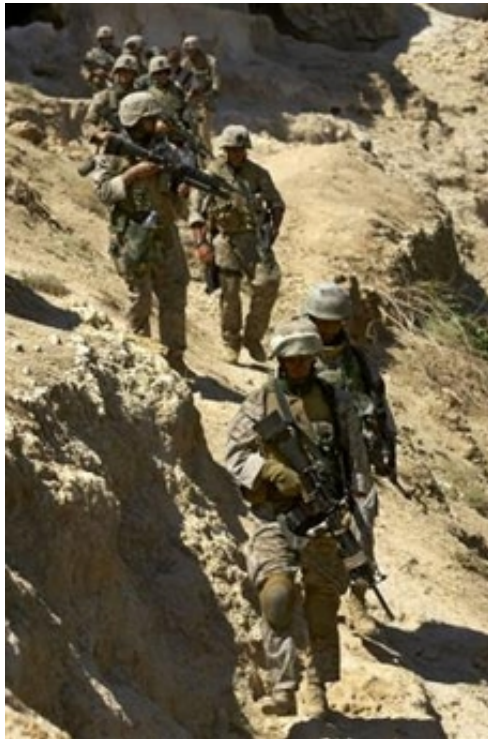
U.S. Marines from Lima Company of the 3rd Battalion, 25th Regiment from Ohio, walk along a cliff in Parwana, near Haditha, Aug. 6, 2005.

REALLY BAD PLACE TO BE: BRING THEM ALL HOME NOW