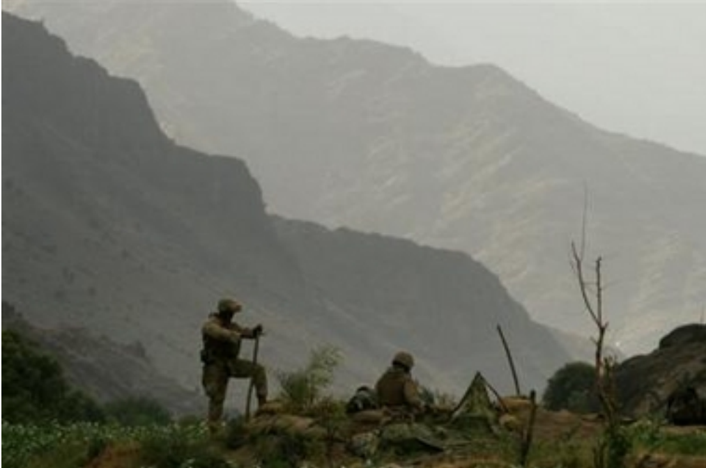
U.S. Marines prepare for rain in their trench in Kandagal village, Kunar province, eastern Afghanistan, Aug. 11, 2005.