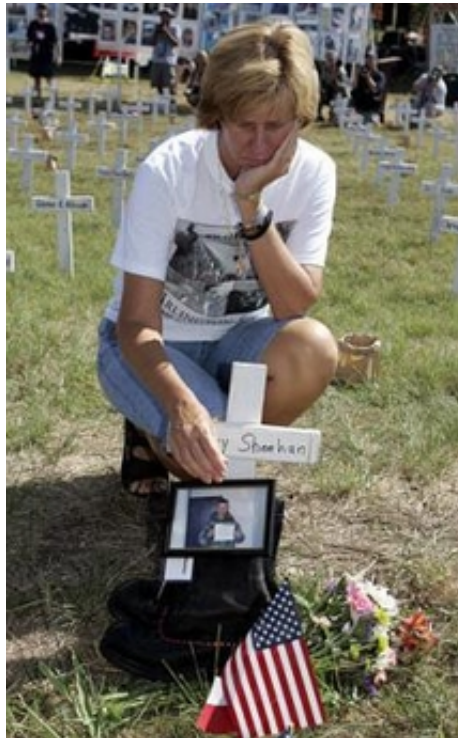
Cindy Sheehan takes a moment after placing her son's boots at the cross bearing his name at 'Camp Casey', named after her 24-year-old son, Army Spc. Casey Sheehan, who was killed last year in Iraq, Crawford, Texas, Aug. 25, 2005.

Gold Star Mother Asks: “Why Have Their Deaths Not Been In Vain?”