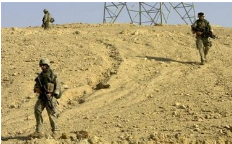
U.S. Army soldiers search for explosive devices on the side of a road in Baghdad August 5, 2005.