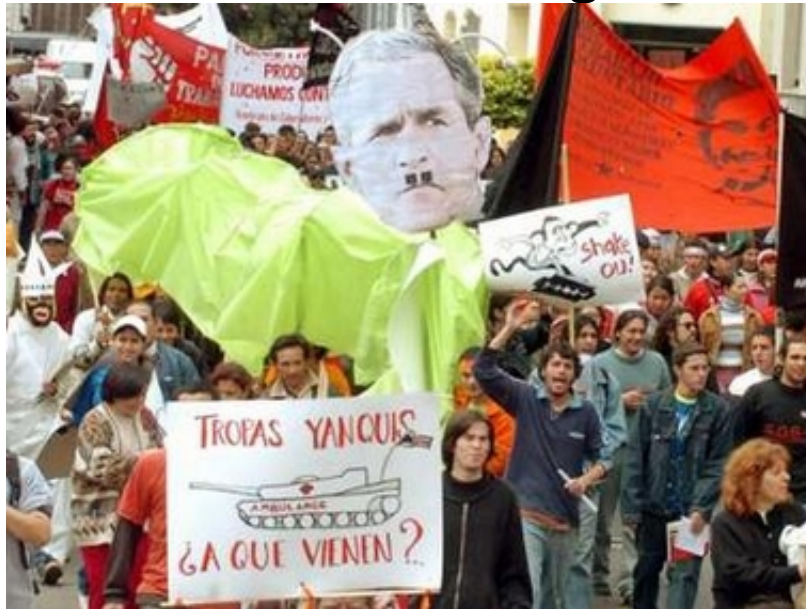
Paraguayans march during a demonstration in downtown Asuncion September 17, 2005 while protesting against the presence of U.S. troops and reservists. The sign reads, 'Yankee troops. What are they here for?'