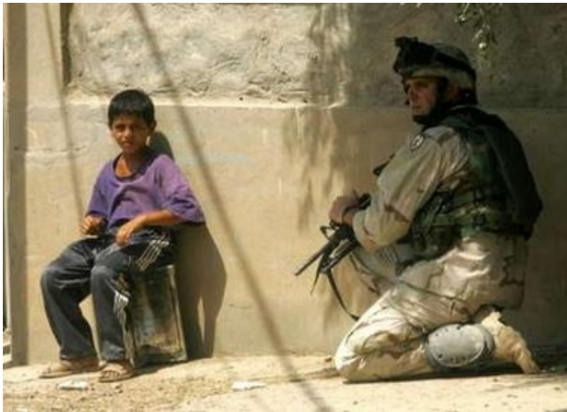
A U.S. soldier from the Stryker brigade during a patrol in Mosul, northern Iraq, July 29, 2005.

Guess Who's Worried Guess Who Isn't Guess Why BRING THEM ALL HOME NOW