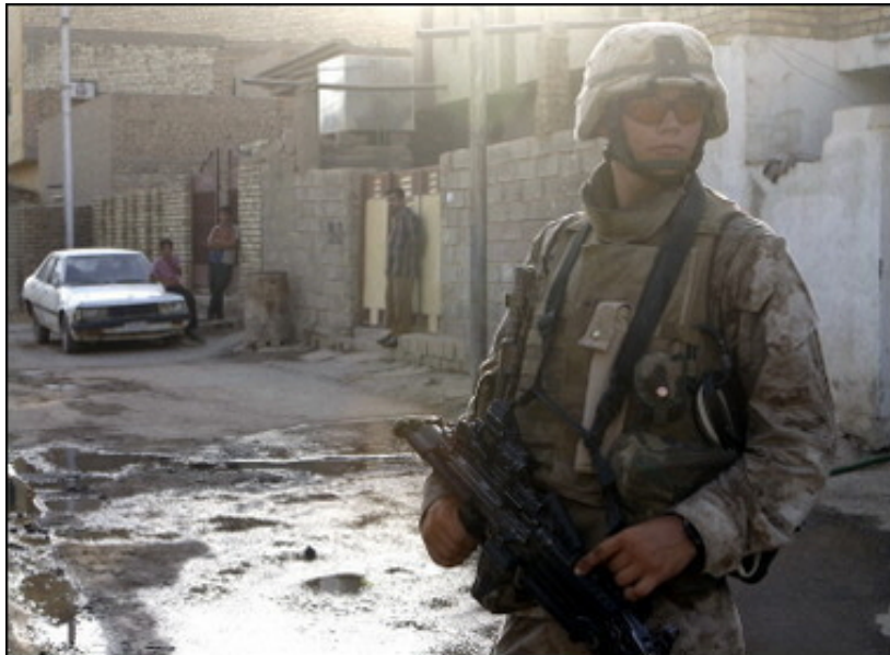
US Marine in Fallujah.