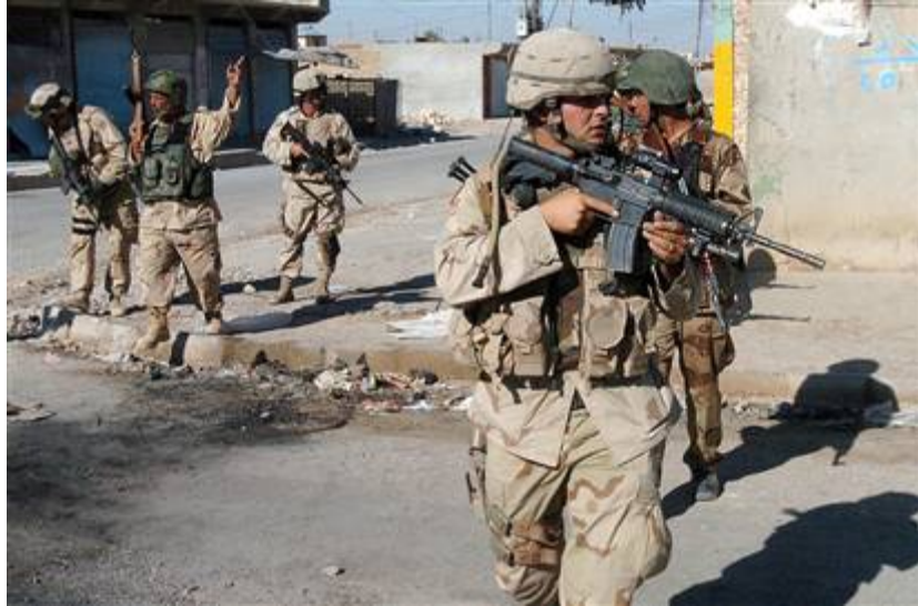
U.S. Army and Iraqi soldiers patrol in Tal Afar Sept. 11. 18

Since 2003, U.S. forces have detained 40,000 people, twice U.S. generals' highest public estimate of the number of fighters in the insurgency.