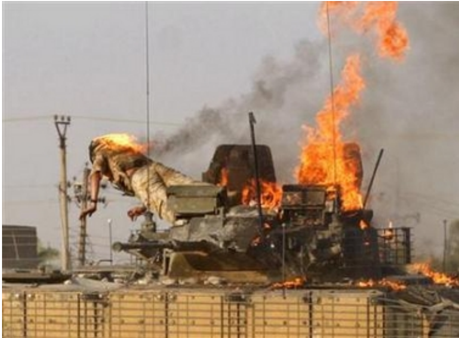
A burning British soldier jumps from a tank, Basra September 19.