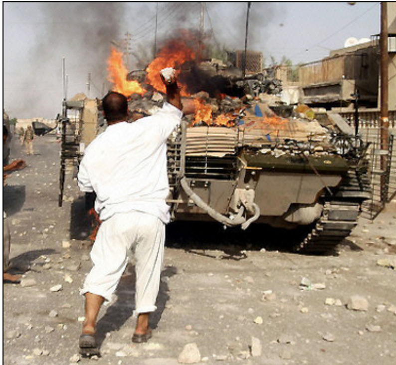
An Iraqi protester throws stones at a British tank during clashes in Basra 9.21.05.

Sources at the joint coordination center said that the US forces sealed off the scene and the wounded were rushed to hospital.