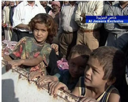
Children are among those stranded on the Iraq-Syria border