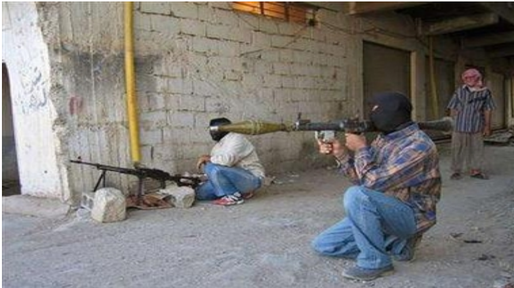
Armed insurgents keep watch on a street in Ramadi October 3.