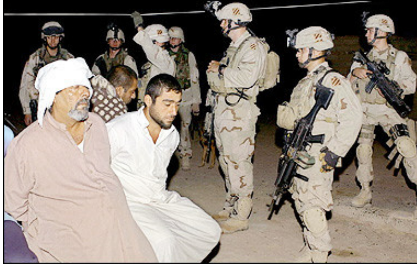
US soldiers from Delta company 2/7 infantries division guard arrested suspected insurgents during an overnight raid in Tikrit.