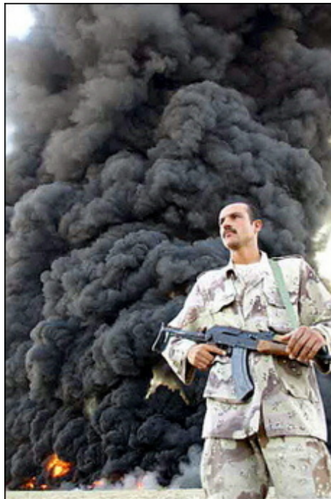
Oil pipeline burning in Safra.