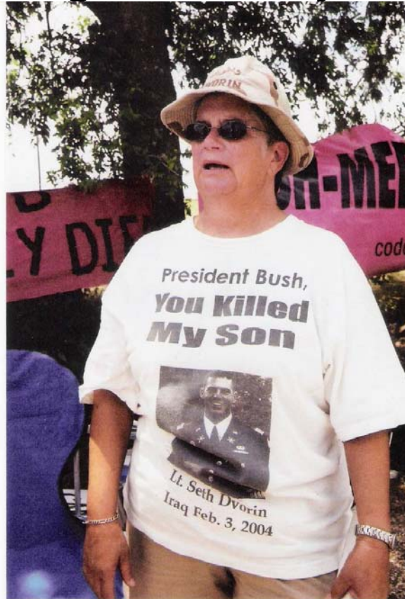
Camp Casey, Crawford, Texas 2005