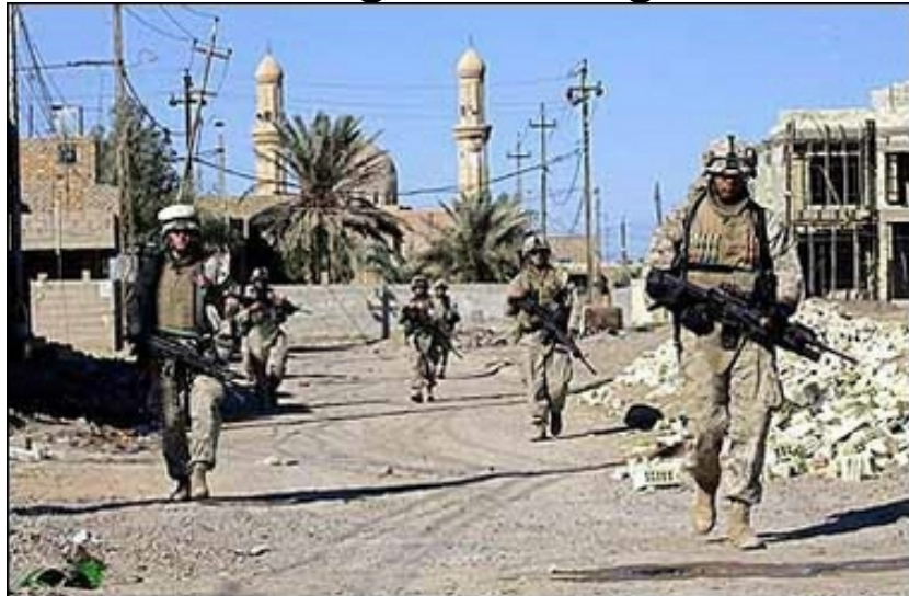
US Marines from 1st Platoon Echo Company 2nd Battalion 7th Marine Regiment conduct a foot patrol through the streets of Fallujah.