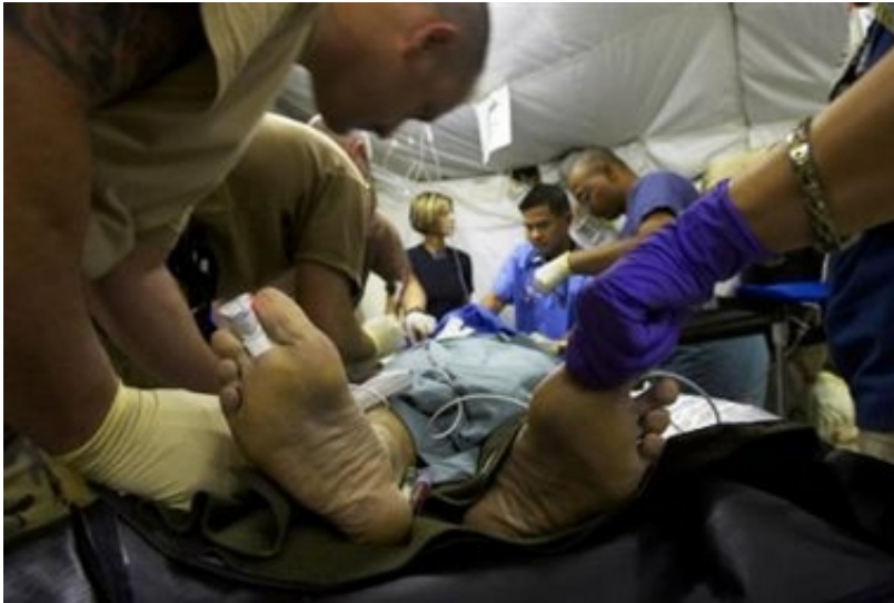
U.S. Army soldier who was shot in the head, at the Air Force hospital in Balad Nov. 10, 2005. The soldier later died during surgery.