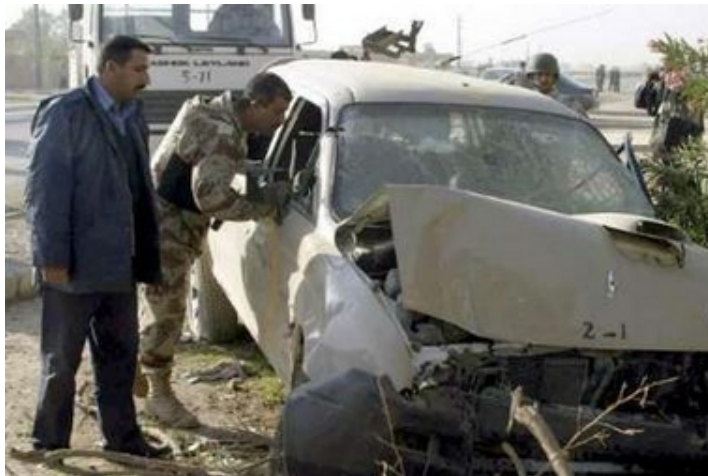
An Iraqi army vehicle hit by a road-side bomb in Kirkuk, November 13, 2005. Five soldiers were injured in the attack, police sources said.