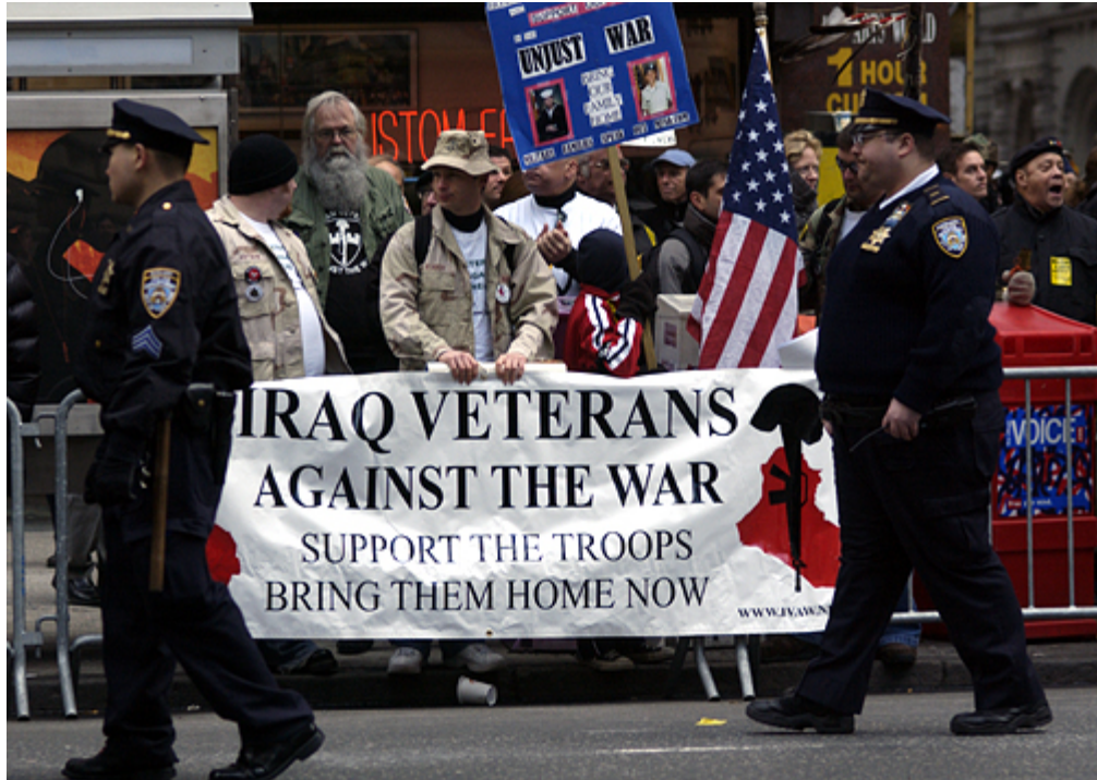
VETERANS DAY NEW YORK CITY