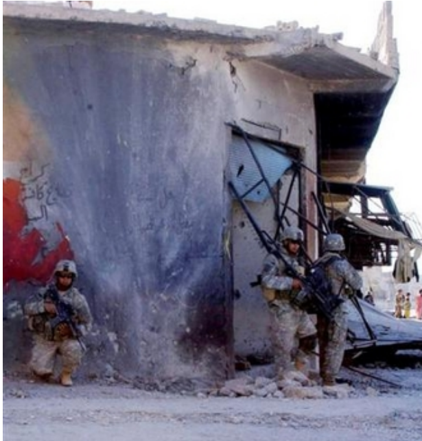
Paratroopers from Company D, 2nd Battalion, 325th Airborne Infantry Regiment, 82nd Airborne Division, in Tal Afar, Iraq Nov. 12, 2005.