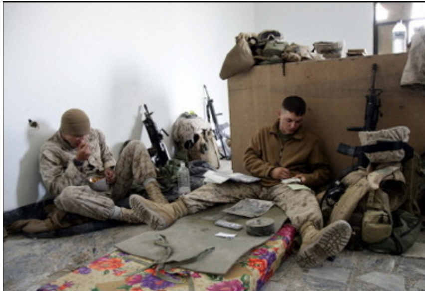
US Marines in an occupied Iraqi building in Zaidon.