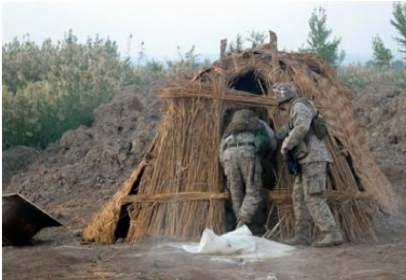
Nov. 19, 2005: Marines of Company G., 2d Battalion, 6th Marines search a small shack looking for hidden weapons, in Saqlawiyah.

ONLY 137,904 MORE LEFT TO SEARCH: MISSION IMPOSSIBLE, LETHAL AND PREPOSTEROUS: BRING THEM ALL HOME NOW!