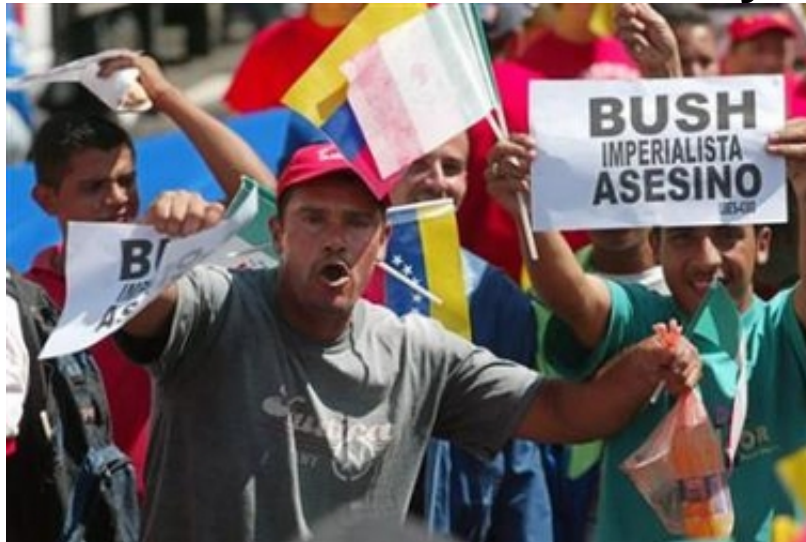
Venezuelans chant anti-Bush slogans during a march in Caracas November 19, 2005. Thousands marched in Caracas.