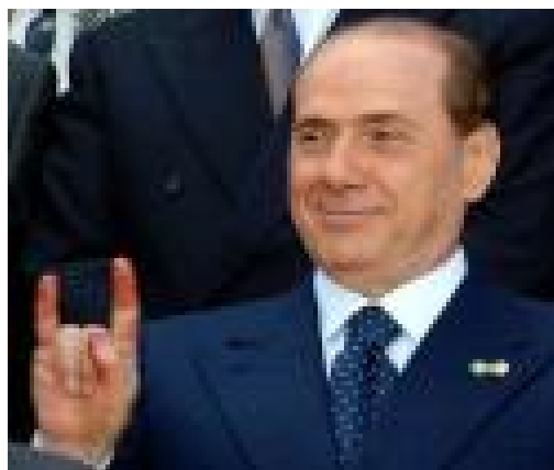
Italian Prime minister Berlusconi