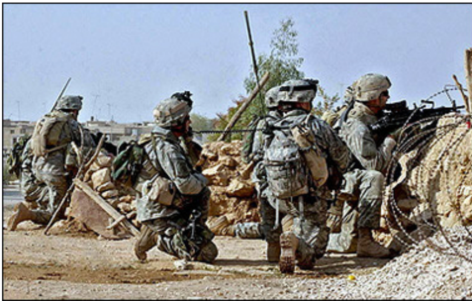
10.24.05 US soldiers in Tal Afar.

REALLY BAD PLACE TO BE: BRING THEM ALL HOME NOW!