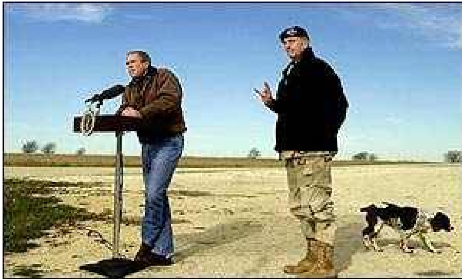
General Tommy Franks

Europeans were shocked and interpreted the gesture as a salute to Satan.