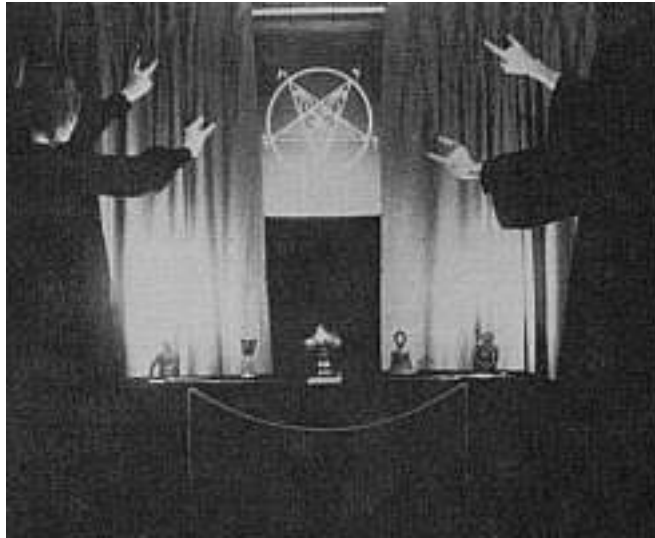
A Satanic Ritual