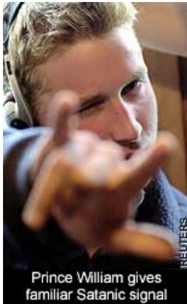
Prince William gives familiar Satanic signal