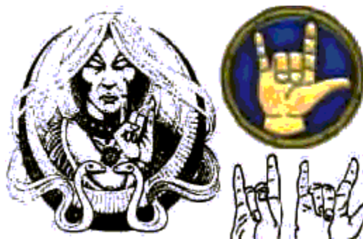
From the "Satanic Bible"