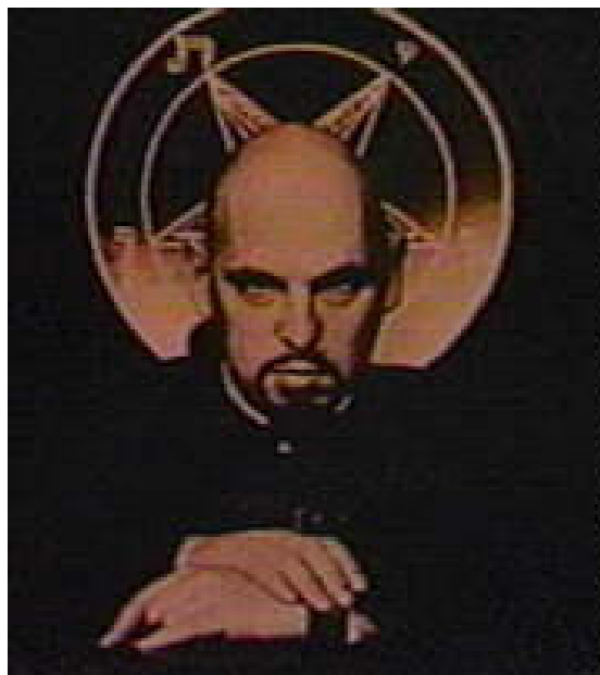
Anton Lavey, Leader of the Church of Satan