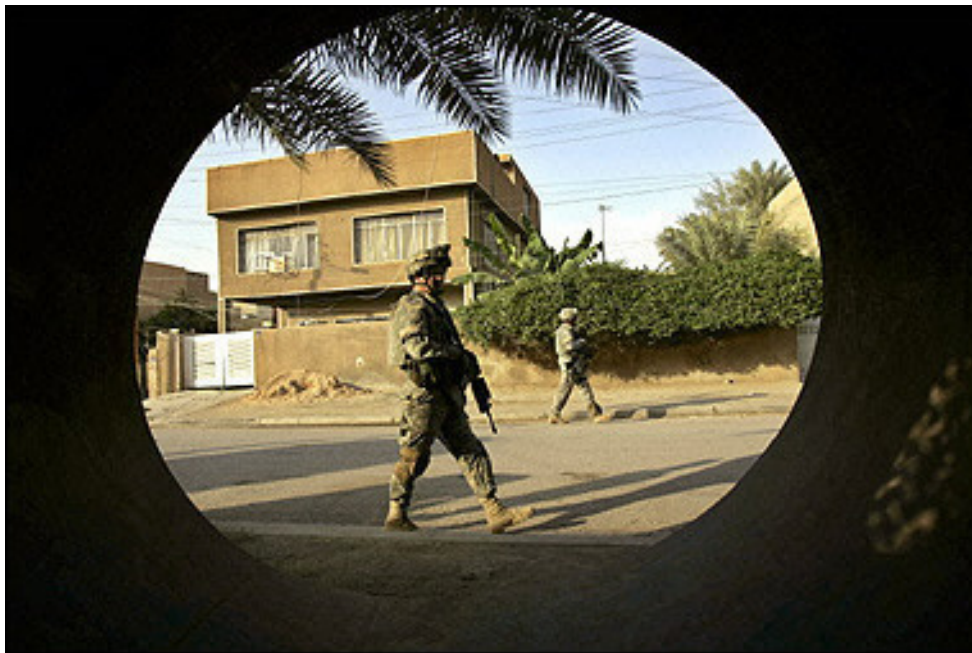
AFP Oct 31, 7:12 PM ET US soldiers from Bravo Company 1-87 Infantry 10th Mountain Division 1st Brigade Combat Team during a patrol in western Baghdad.