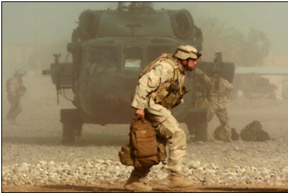
US soldiers return to their base after an assault on Iraqi insurgents south of Baghdad.