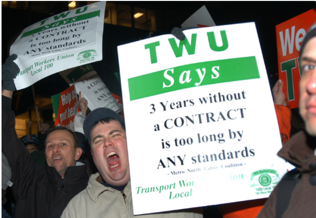
Dec. 19, 2005: Transit Workers Union Rally in front of Gov. Pataki's office on the eve of the strike.