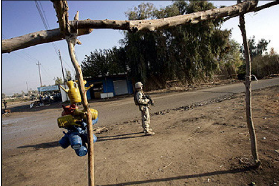
11.05: A US Marine from Echo Company 2nd Battalion 2nd Marine Regiment at a snap checkpoint in the Zaidon area.

LOCATION AT THIS TIME, EXCEPT THAT A TRAITOR WHO LIVES IN THE WHITE HOUSE WANTS YOU THERE, SO HE WILL LOOK GOOD. That is not a good enough reason.