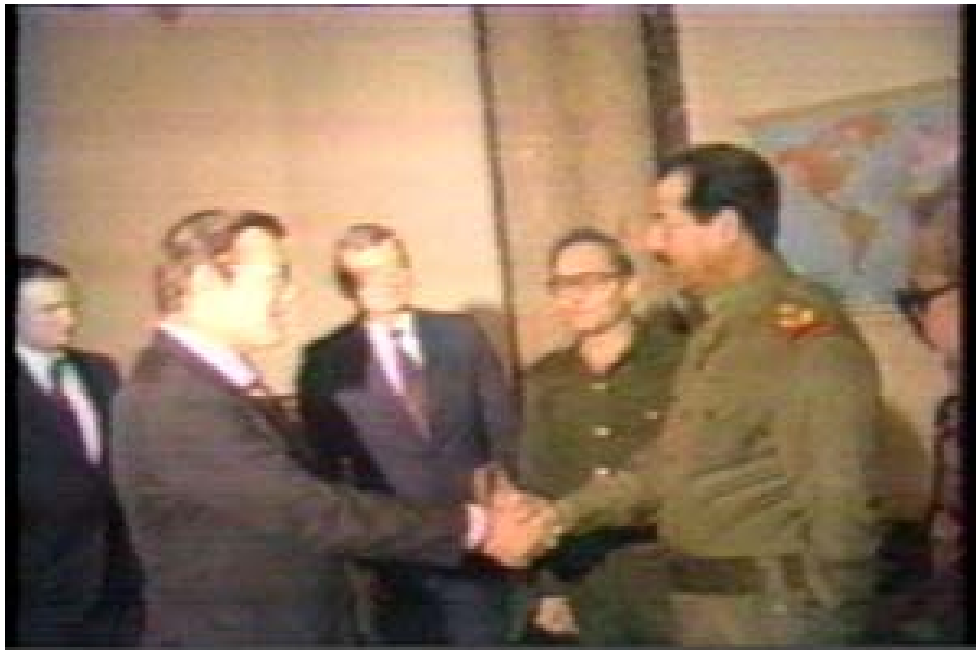
Iraqi President Saddam Hussein greets Donald Rumsfeld, special envoy of President Ronald Reagan, Baghdad, December 20, 1983.

OCCUPATION ISN'T LIBERATION BRING ALL THE TROOPS HOME NOW!