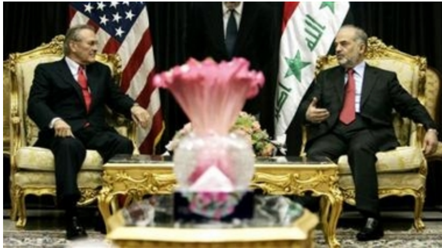
The traitor Rumsfeld, left, meets with his loyal servant, Iraqi collaborator Ibrahim al-Jaafari in Baghdad, Dec. 23, 2005.