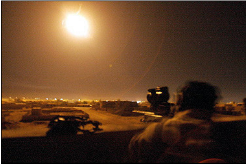
11.18.05: A flare illuminates a neighborhood held by insurgents as a US marine fires near the town of al-Qaim.

REALLY BAD PLACE TO BE: BRING THEM ALL HOME NOW