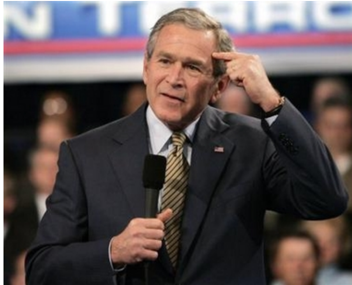
Bush Jan. 11, 2006 in Louisville, Ky.