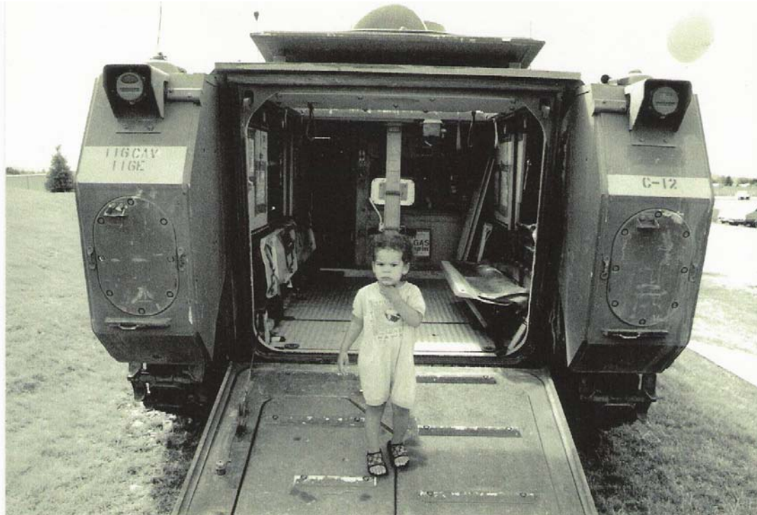
Military recruiters trying to make an impression at a county fair. “War is a disease of childhood.” Albert Einstein