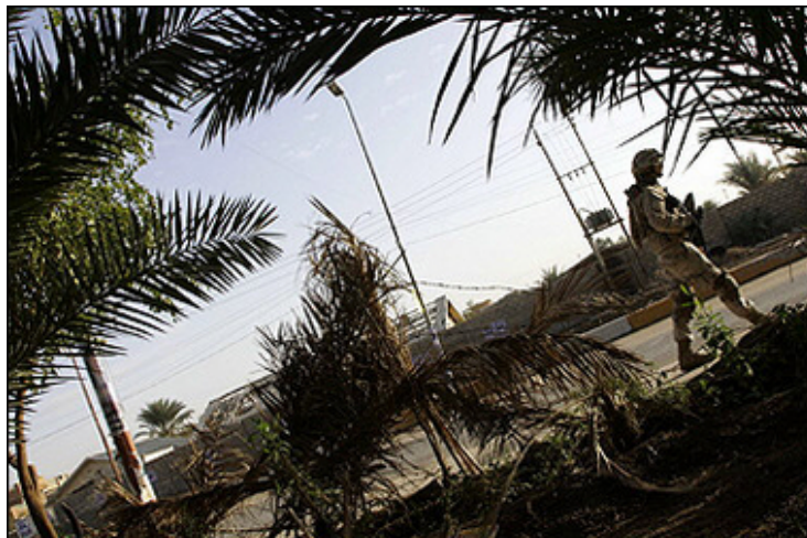
US Marine from the 2nd Battalion, 6th Marines Regiment during a foot patrol in the northern area of Fallujah. A rocket propelled grenade was fired toward an Iraqi police station and a roadside bomb blew up near a bridge at the north entrance to Fallujah.