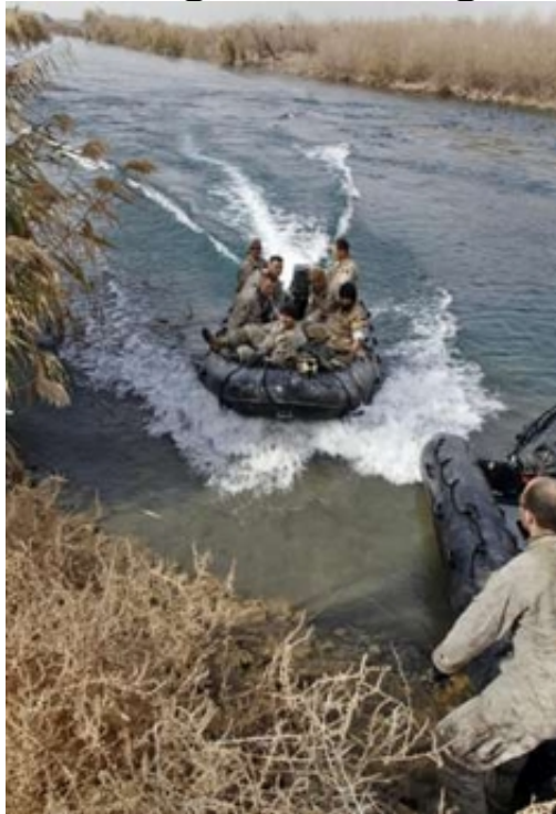
U.S. Marines with the 22nd Marine Expeditionary Unit (MEU) on the Euphrates River as they prepare to search a house near Hit January 24, 2006.