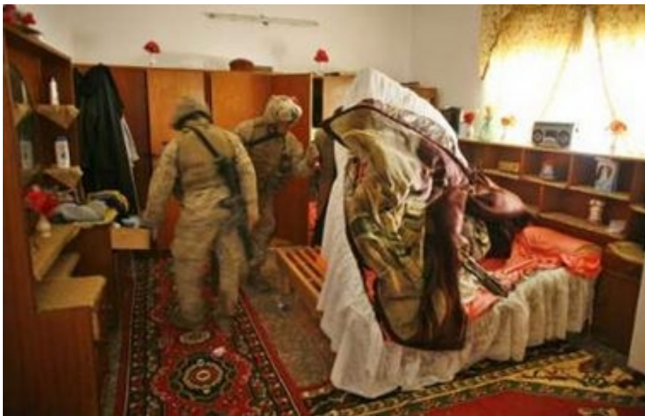
U.S. Marines with the 22nd Marine Expeditionary Unit (MEU) search an Iraqi citizens' house near Hit January 25, 2006.

[Fair is fair. Let's bring 150,000 Iraqis over here to the USA. They can kill people at checkpoints, bust into their houses with force and violence, trash their personal possessions, overthrow the government, put a new one in office they like better and call it "sovereign" and "detain" anybody who doesn't like it in some prison without any changes being filed against them, or any trial.]