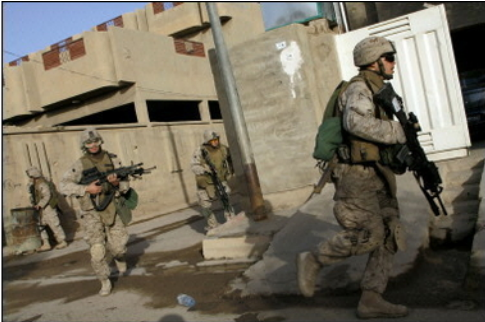
US Marines take cover after coming under fire during a patrol in the northern area of the Sunni city of Fallujah.