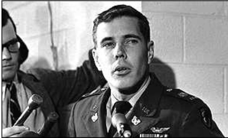
Hugh Thompson

But when he saw Vietnamese survivors chased by soldiers, he landed his chopper between the villagers and troopers, and ordered his crew to fire at any American soldiers shooting at civilians. Then he got on the radio and begged U.S. gunships above him to rescue those villagers he could not cram into his own craft.