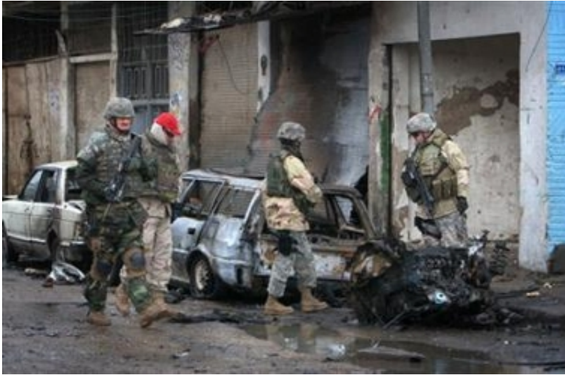
A US military patrol inspects the damage from a car bomb Feb. 3, 2006, in eastern Baghdad.