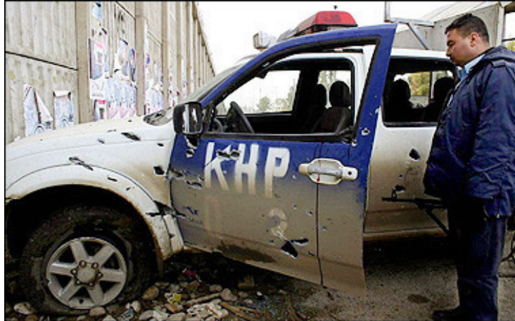
Policeman car that was hit in a roadside bomb in the northern city of Kirkuk.

Feb. 12, 2006 By ASSOCIATED PRESS & Reuters & Aljazeera