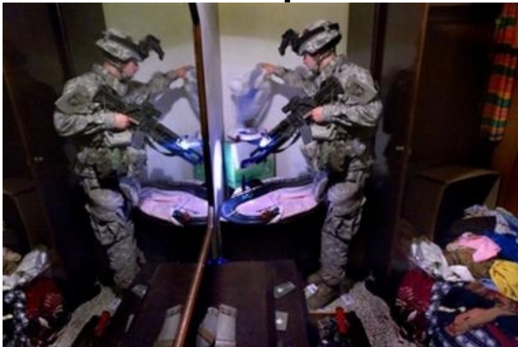
An American soldier searches a house during a raid in Ramadi, Feb. 4, 2006.