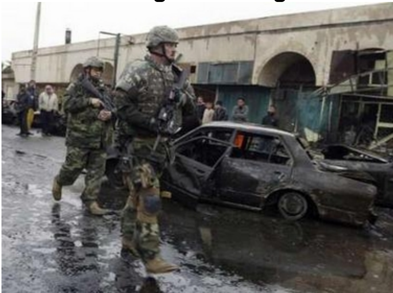
U.S. soldiers at the scene of bomb attack in Baghdad February 3, 2006.