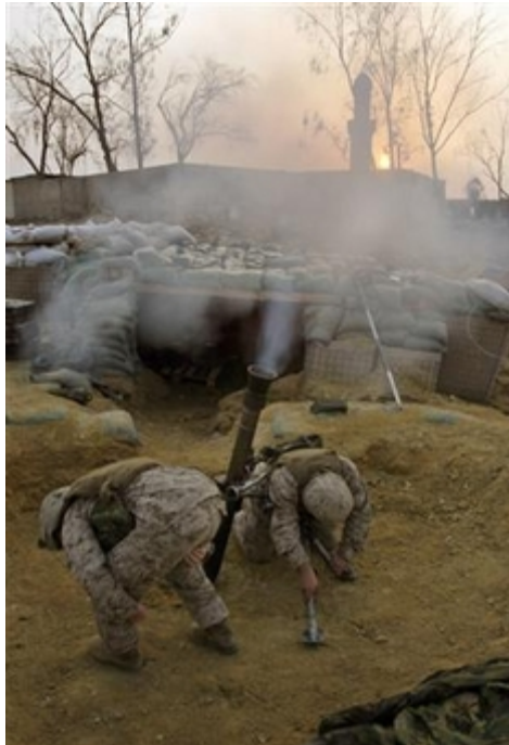
U.S. Marines from the 22nd Marine Expeditionary Unit fire 81mm mortars near the western Iraqi town of Hit, February 7, 2006.