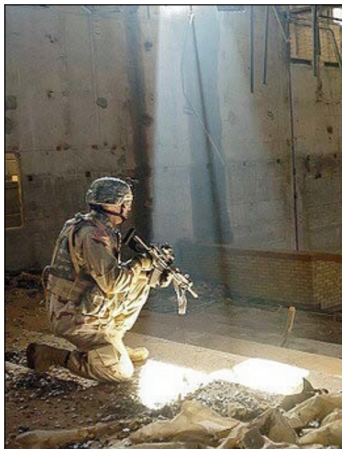
2.9.06: A US soldier in a building in the Hateen weapons compound in the town of Hsawa, south of Baghdad.

REALLY BAD PLACE TO BE: BRING THEM ALL HOME NOW!