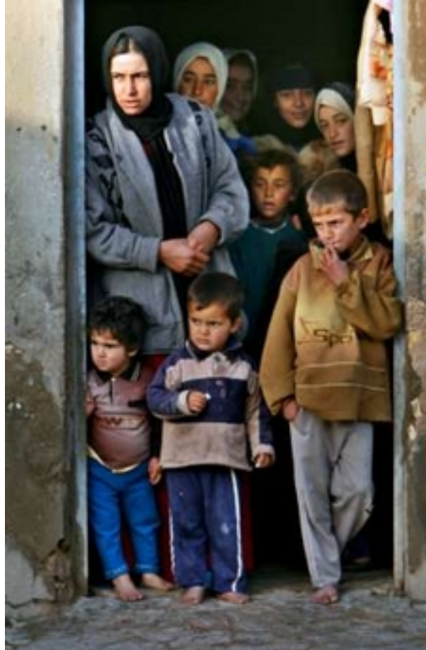
Iraqi women and children wait as foreign troops from the 22nd Marine Expeditionary Unit (MEU) search their home in the village of Abu Rayat February 4, 2006.